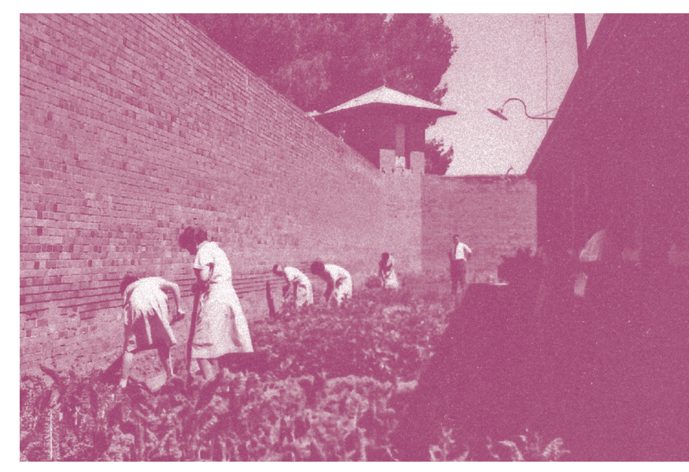
Working in the garden at the Hay institution for Girls.